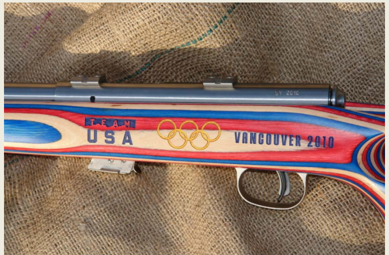
Baron engraved all 50 Savage Arms Mk II BTVS rifles that were auctioned off to benefit the U.S. Biathlon Team. After the laminated stocks were engraved, they were meticulously hand-painted with blue and gold.

Baron engraved and hand-painted the left side of each gun’s special red, white and blue laminated stock with the inscription “Team USA Vancouver 2010” and the United States Biathlon Association logo (both painted in blue). Also, each engraved-in-the-USA rifle featured a serial number that included a state designation and the year: 2010.